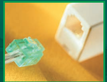
No Central Office Necessary just plug a touch-tone telephone into the apartment phone jack