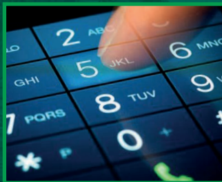
Control Access with a simple push of a button on your touch-tone telephone