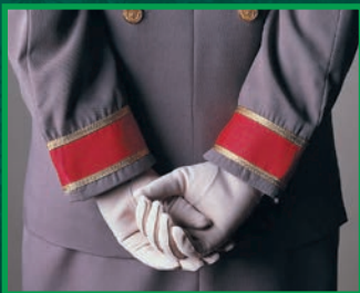
Doorman Telephone inputs for high-rise apartment buildings

APARTMENT COMPLEXES • MIXED USE CONDOMINIUM/RESIDENT HALLS • COMMERCIAL