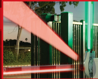
Lighted Top Arm for added visibility and safety