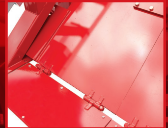
Heavy Duty Reinforced Steel Wedge damages barrier runners vehicles