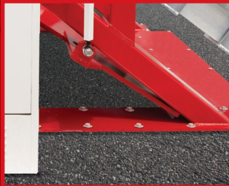
Surface Mount for quick and easy installation or where inground digging is prohibitive