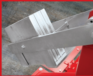
Fast Raise and Lower of the heavy steel wedge is possible with the use of precise counter weight

CAR RENTAL LOTS • COMMERCIAL AND INDUSTRIAL TRAFFIC CONTROL • INFRASTRUCTURE FACILITIES • PENITENTIARY TRANSPORTATION AND SHIPPING MAXIMUM SECURITY